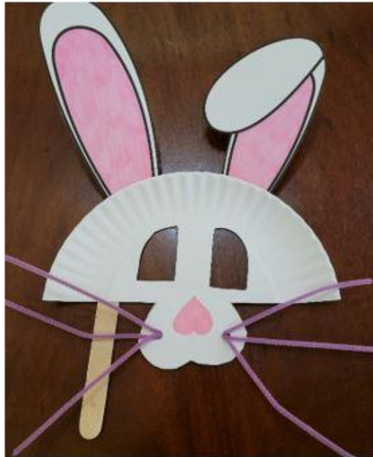
Easter Bunny Mask